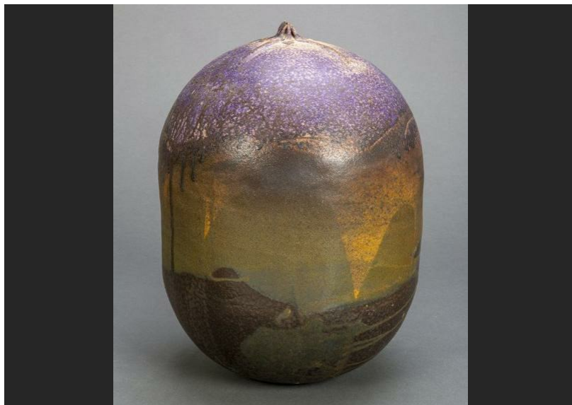
"Purple Closed Form" by Toshiko Takaezu.