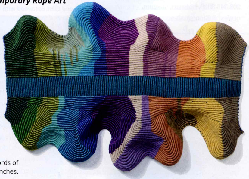
Bandwidth , Al Canner. Knotting (macramé). Cords of cotton, polyester, and rayon. 22 x 15.5 x 2.5 inches.

For more information: 508.495.1878, highfieldhallandgardens.org/current-art-exhibits/unbound-contemporary-rope-artjune-2019/