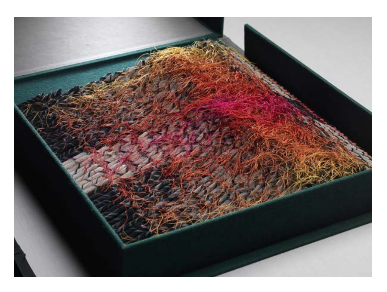
(Racine, WI) — The Box Project: Uncommon Threads at Wisconsin's Racine Art Museum

Racine Art Museum (RAM) is pleased to present The Box Project: Uncommon Threads showcasing commissioned works by 36 of the world's top fiber artists. These artists, many of whom work on a large scale, were challenged to create an original piece within the confines of a small box. Organized by the Cotsen Foundation for Academic Research (CFAR) with RAM, this traveling exhibition presents works