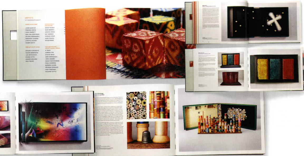
The Box Project: Works from the Lloyd Cotsen Collection Edited by Lyssa C. Stapleton Cotsen Occasional Press, $95

IMAGINE RECEIVING A SMALL box – a rectangle or a square, only 3 inches deep – and being asked to fill it with a work of art using fiber, in the broadest sense of the medium. What would you make?