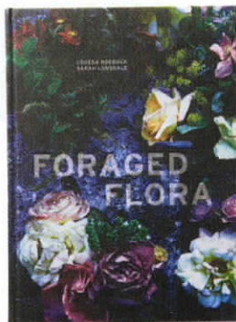
Foraged Flora: A Year of Gathering and Arranging Wild Plants and Flowers