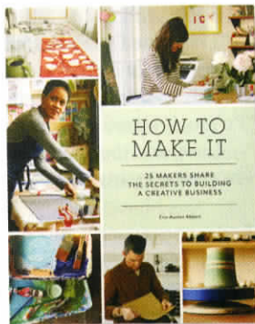
How to Make It: 25 Makers Share the Secrets to Building a Creative Business