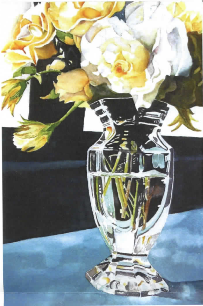
Karen Finerty, "Yellow Roses in Waterford"