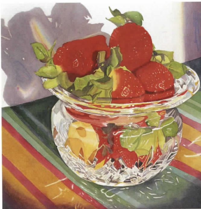
Karen Finerty, "Berries in Crystal"