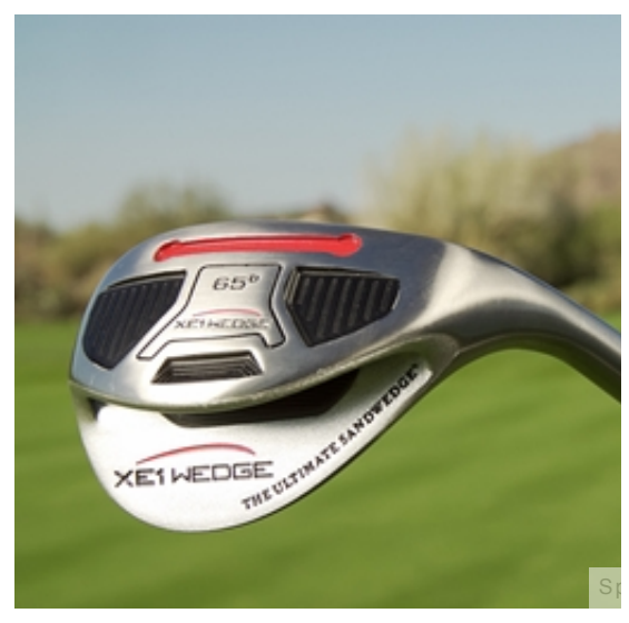
This $99 Golf Club Can Replace Every Wedge in Your Bag