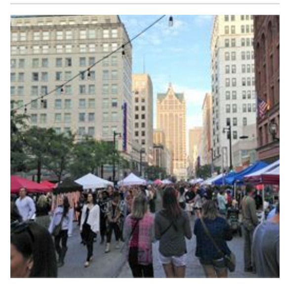
Westown Wednesdays' Programming Creates Meaningful Connectivity Throuthe Summer