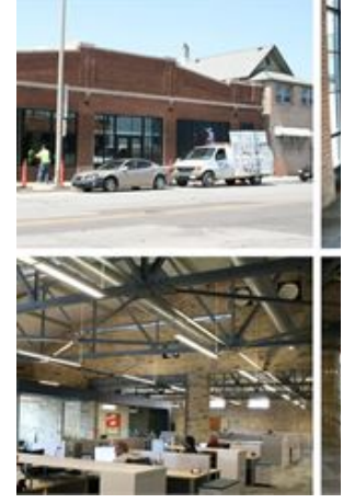
Eyes on Milwaukee: Inside Bray Architects in Walker's Point