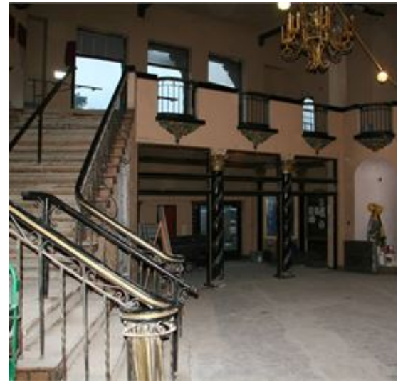
Eyes on Milwaukee: Return of The Ave Theater

Jul 21st, 2016 by Racine Art Museum This free performance series invites the public to view the many talents of local and nationally recognized performance artists