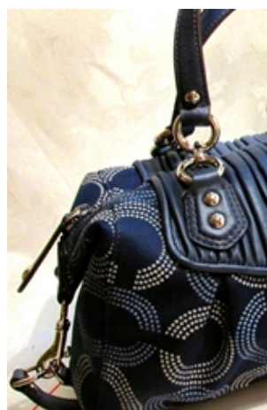
Why Women Are Flo Incredible New Shop