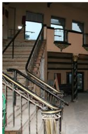
Eyes on Milwaukee: Avalon Theater