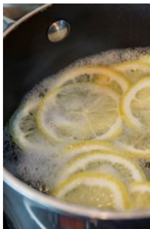
How To Fix Your Fati Every Day)