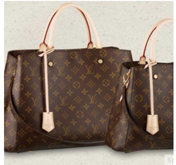
Why Women Are Flocking to This Incredible New Shopping Site

Jun 1st, 2016 by Racine Art Museum The Wright & Like 2016 tour features guided interior tours of private