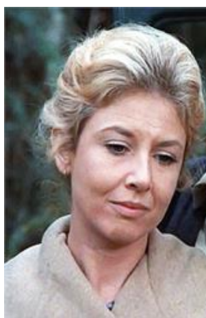
12 Things The Produ Walton's Hid