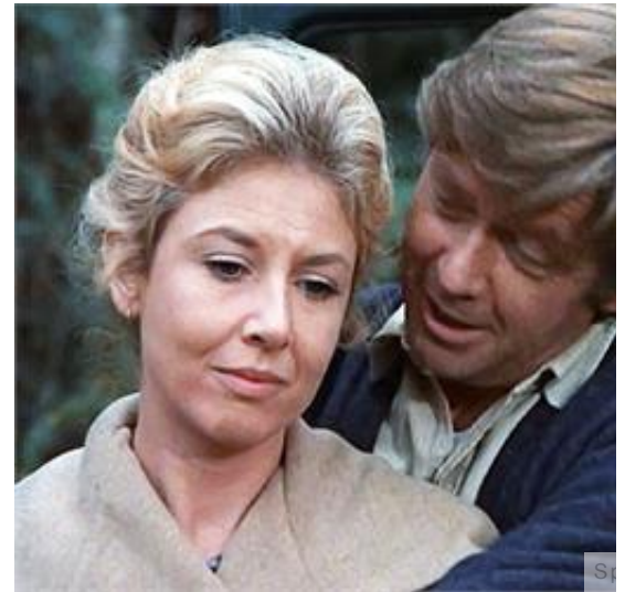
12 Things The Producers Of The Waltz Hid