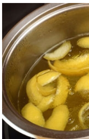
Melt Your Fat Like Bu