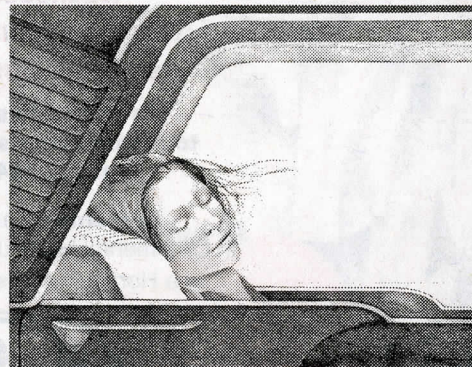
"At Rest on the Expressway, 1966" by Nancy Ekholm Burkert from the 1967 "Watercolor Wisconsin" exhibit.

Not afraid to use jewelry to share stories or reflect emotion, many contemporary art jewelers create work that is thought-provoking and engaging. Even when not being worn, their pieces