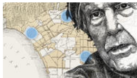
TIMELINE: John Cage's Los Angeles