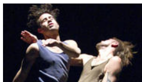
PHOTOS: Arts and culture in pictures