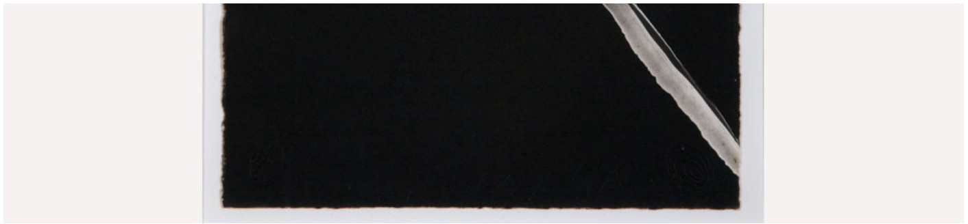
Frank Boyden, Owl and the Moon, 1998. Cliché Verre, edition 7/15, 8 1/2 x 7 1/2 inches. Racine Art Museum, Gift of the Artist.