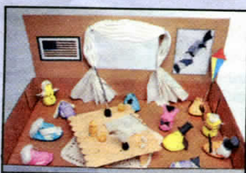
"We the Peeps"