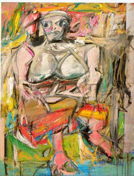
THE WILLEM DE KOONING FOUNDATION/ARTISTS RIGHTS SOCIETY

■ The first major museum retrospective of Willem de Kooning, considered one of the most prolific artists of the 20th century, is