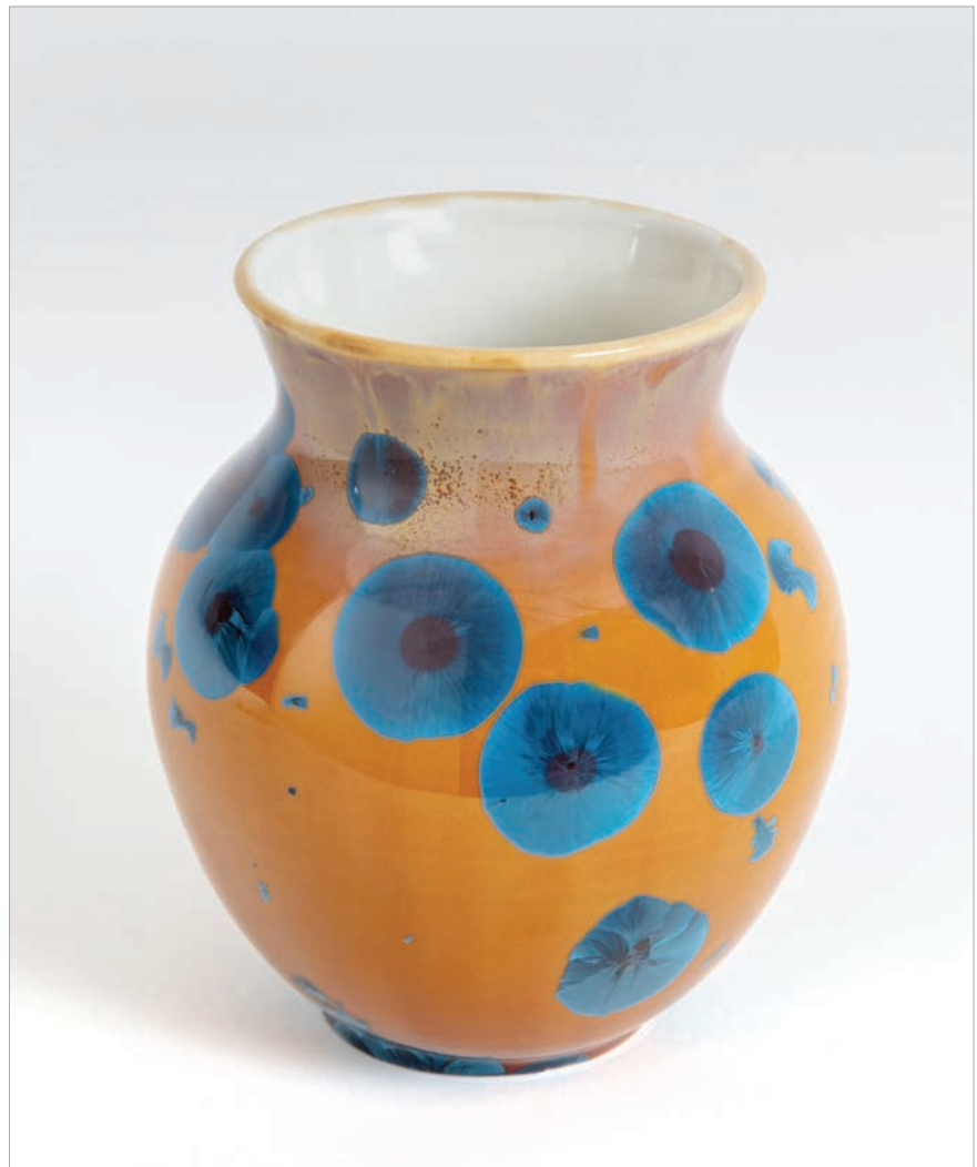
(opposite) Meghan Burke McGrath Twelve Hour Brunch , 2020 Acrylic and oil pastel