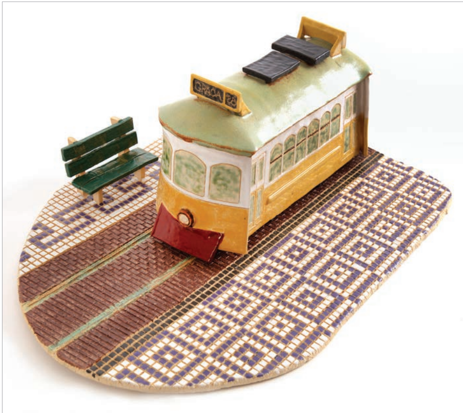
Nick Schroeder Landscapes of the Mind: The First Tram of the Morning , 2019 Glazed white stoneware and ceramic decal

Beth Tivol Kenosha Honey I Shrank the Cookware! , 2019 Copper and sterling silver NFS