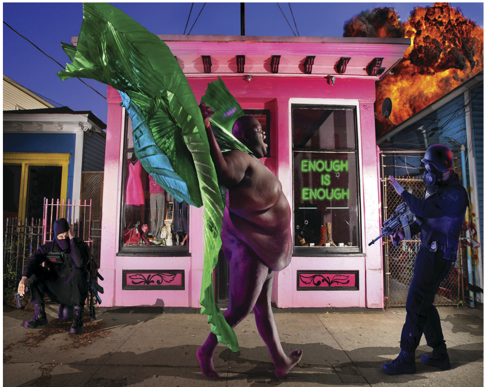
(right) Larry Zamba Enough is Enough! , 2019 Digital inkjet print on aluminum

Works marked NFS are not for sale or are collection of the artist.