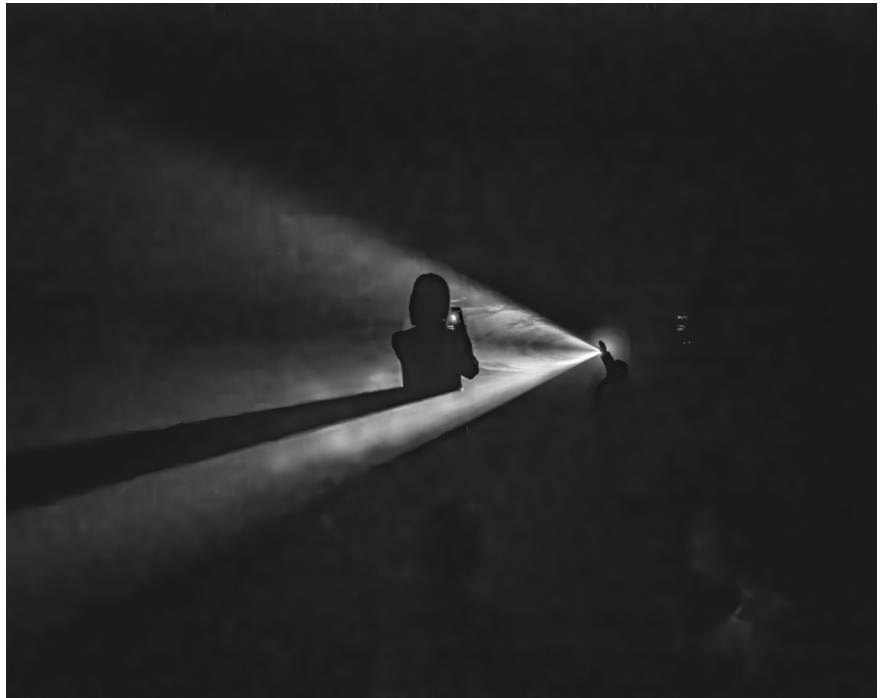
Kristine Hinrichs Day at the Museum, 2018 Digital inkjet print

Ascendant, 2018 Digital inkjet print on aluminum $3,000 Racer Gurl, 2018 Digital inkjet print on aluminum $3,000 Enough is Enough!, 2019 Digital inkjet print on aluminum $3,000 Plague Doctor vs. Umbrella Man, 2020 Digital inkjet print on aluminum $3,000