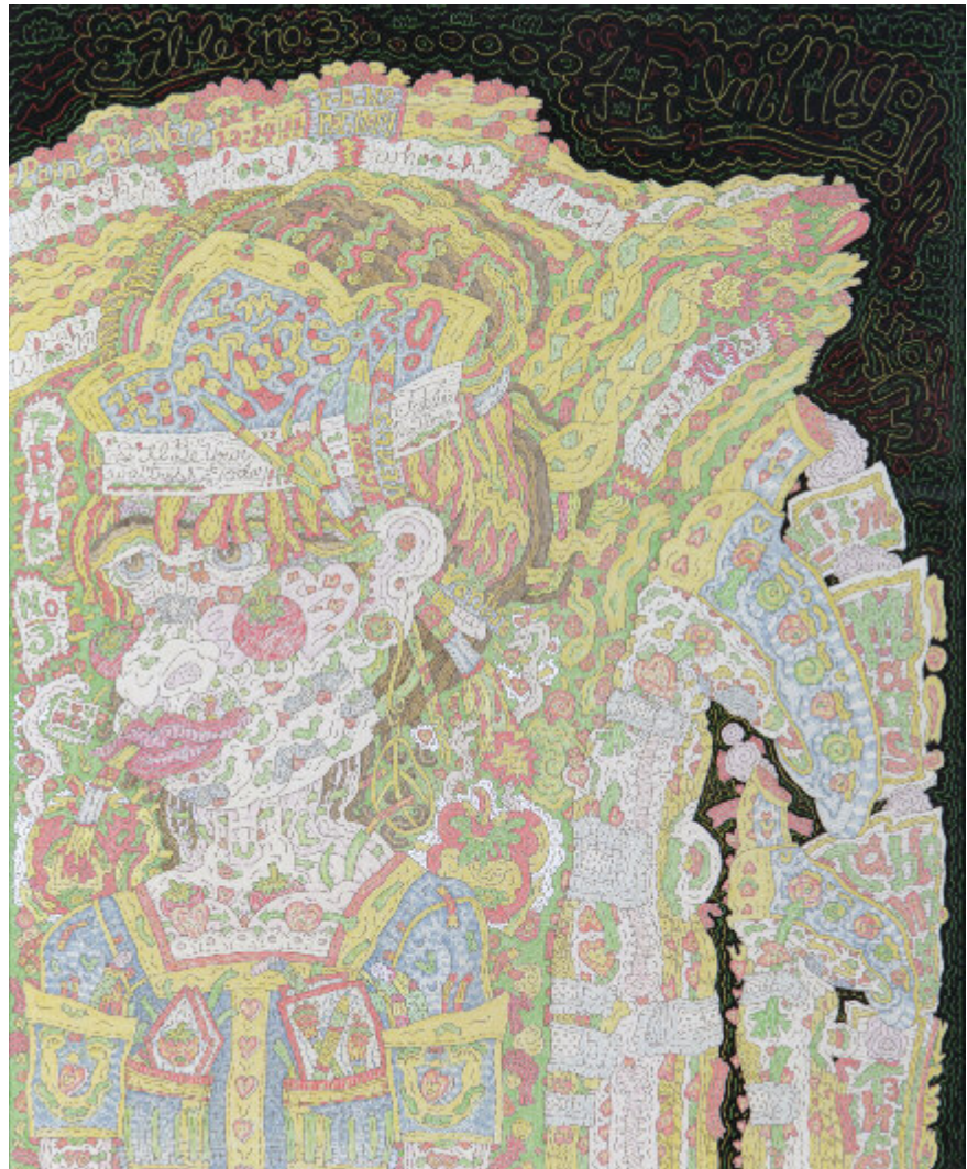
(opposite) Kiefer Ledell Representation of an Ant Colony , 2017 Ink