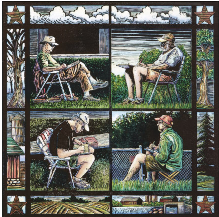
(opposite) Jean Crane Lilies in Space , 2017 Watercolor