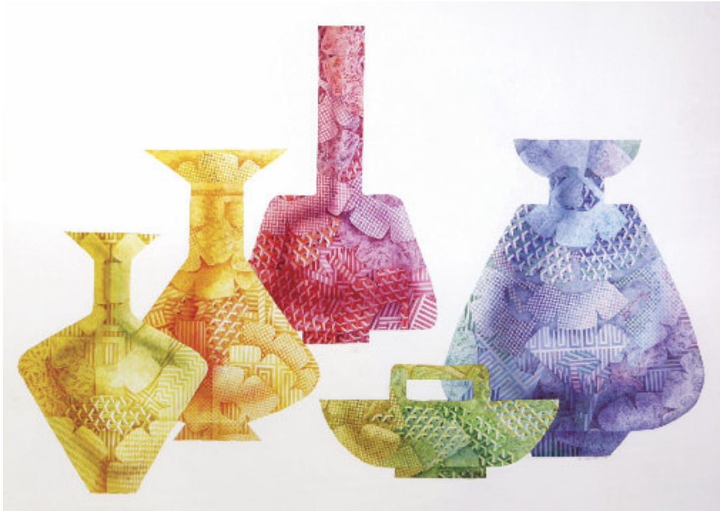
Lisa Englander Vessel Series #9, 2017 Transparent watercolor