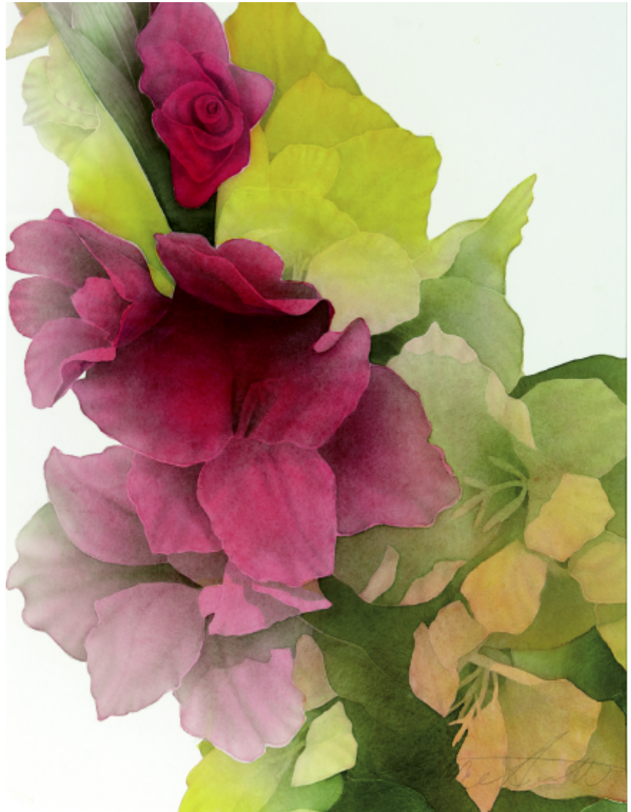
(above) Bruce Hustad Glad Glads , 2015 Watercolor

As Watercolor Wisconsin begins its 49th year, the 2015 exhibition includes 116 pieces by 93 artists, selected from a total of 301 works submitted by 170 artists.