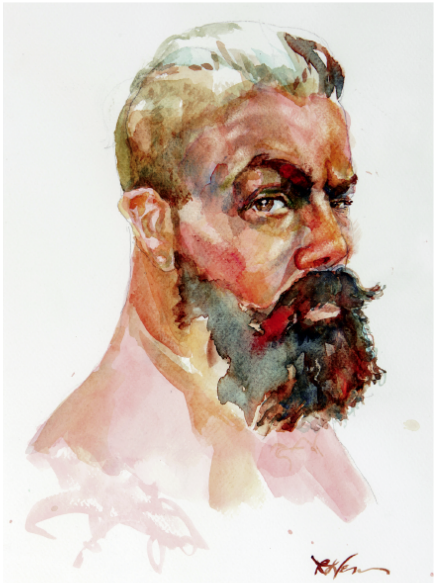
(opposite) Doug DeVinny Pulling Together , 2015 Etching with watercolor