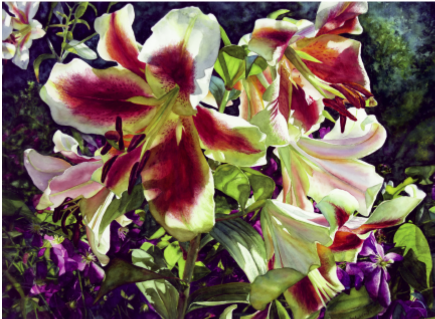
Sue Wolff Lilies I , 2015 Watercolor

Alice Struck Sunday Morning , 2014 Transparent watercolor