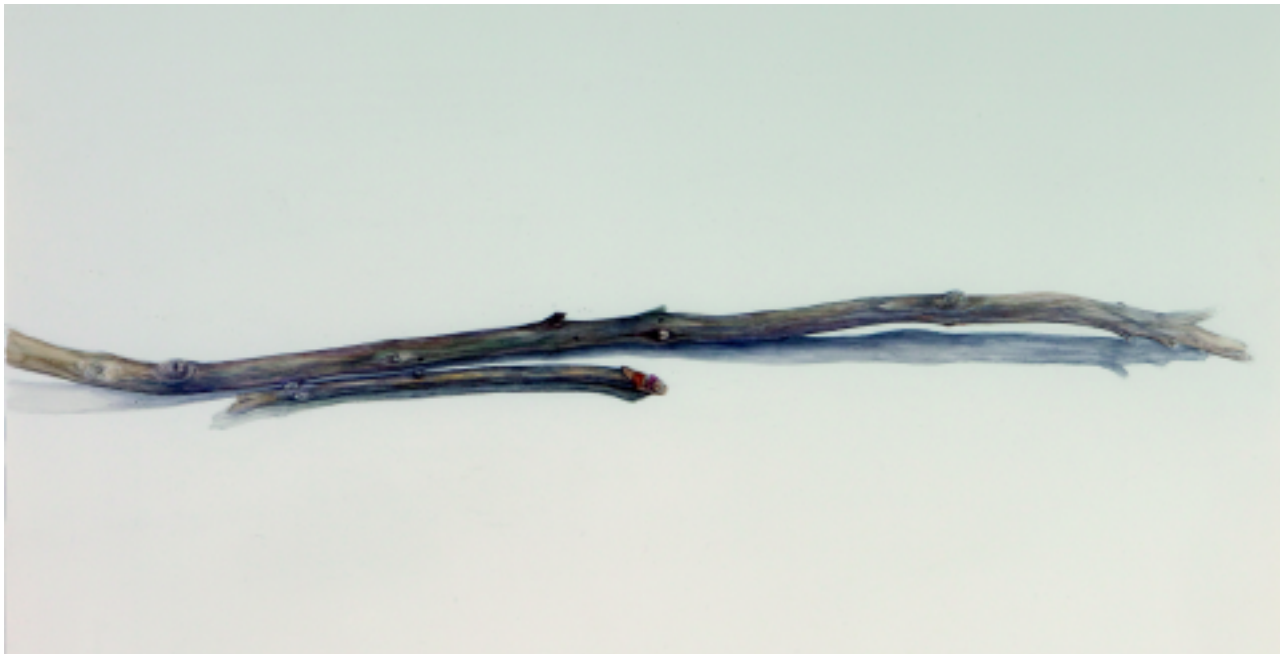
Priscilla Weissenfluh Stick #7, 2010 Watercolor