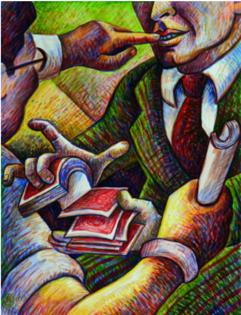
Patrick Doughman Not Another Trick! , 2011 Watercolor and tempera

As Watercolor Wisconsin begins its 45th year, the 2011 exhibition includes 126 pieces by 77 artists, selected from a total of 292 works submitted by 153 artists.