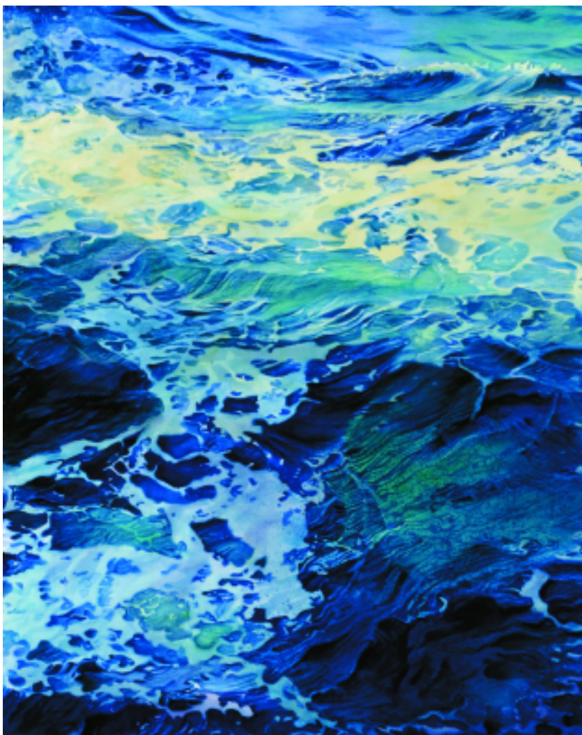
Amy Arntson Too Deep III , 2010 Transparent watercolor