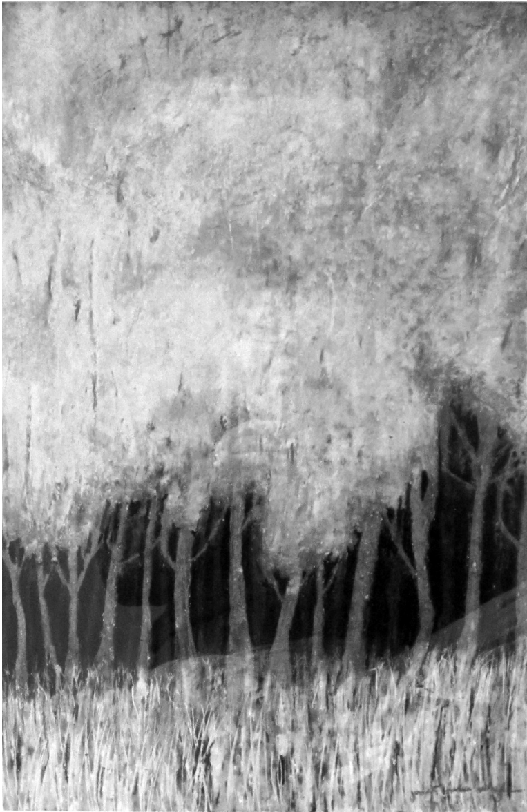
Plate 5 Janet Mrazek Wayside Oil pastel