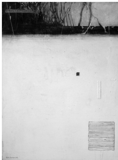
Plate 1 (cover) Janet Hoffman Hospital Gothic Oil