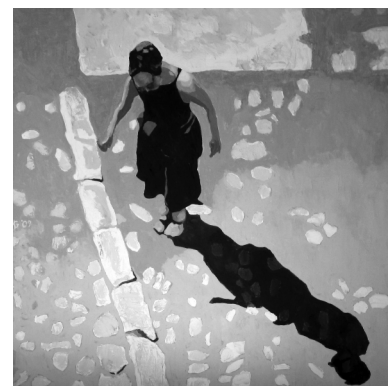
Plate 4 Nancy J. Greenebaum Sun Shadow Oil

Maureen Fritchen Beneath It All $1,200 Equilibrium $800 Mixed media