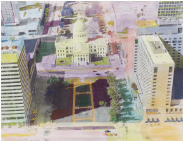
Plate 4 Fred Stein You Raise Me Up , 2009 Watercolor on silver gelatin print

As Watercolor Wisconsin begins its 43rd year, the 2009 exhibition includes 106 pieces by 87 artists, selected from a total of 295 works submitted by 164 artists.