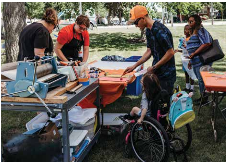
Full Steam Ahead 2023 at Wustum

Racine Art Museum Association, Inc. 39-1018155