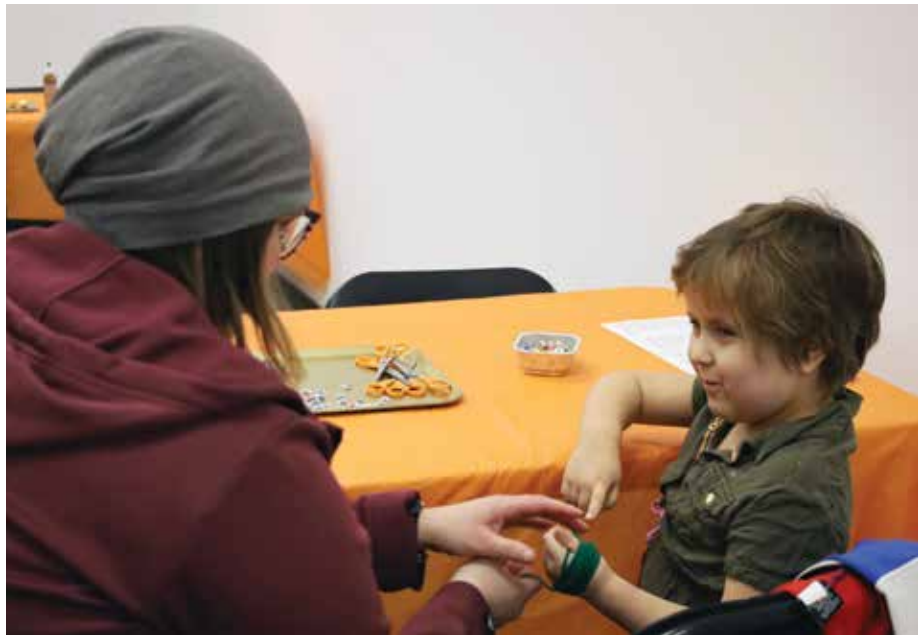
Free Family Hands-on Art Activity at RAM