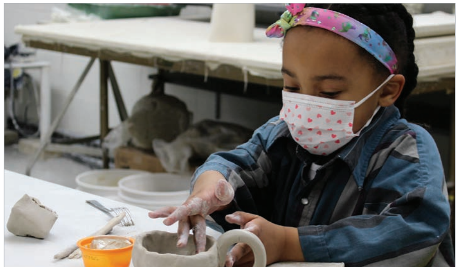
Kids' Art Class at Wustum