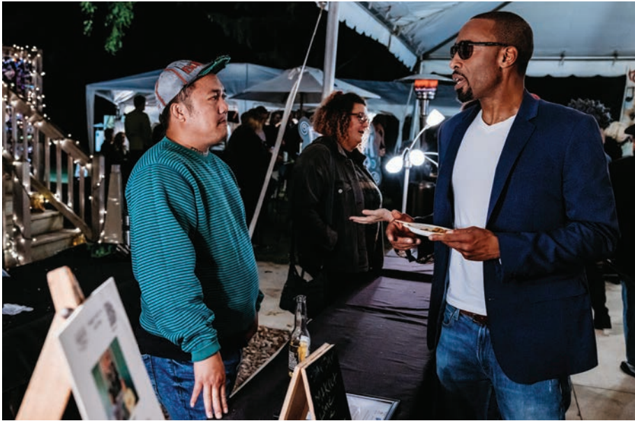
SAVOUR 2021 Fundraiser at Wustum