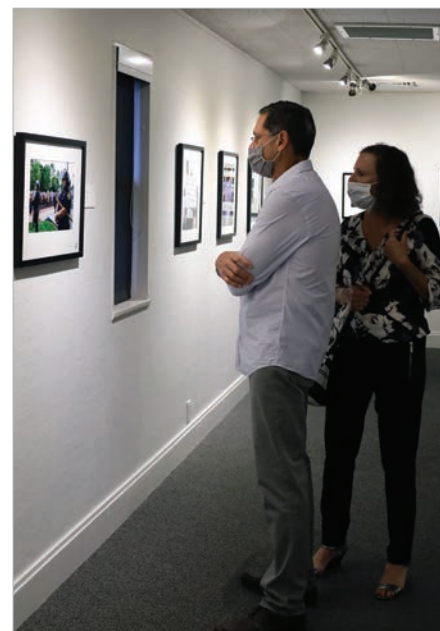
In the Wustum Galleries 2021