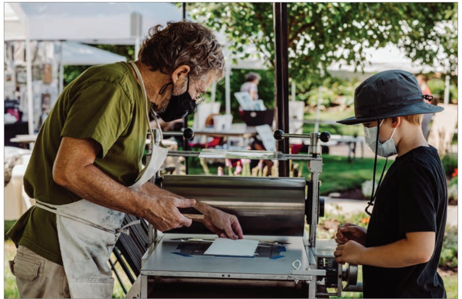
Full Steam Ahead 2021 at Wustum