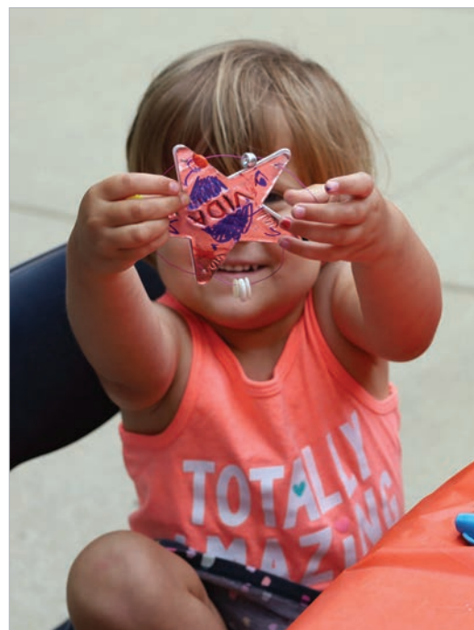
Free First Fridays at RAM