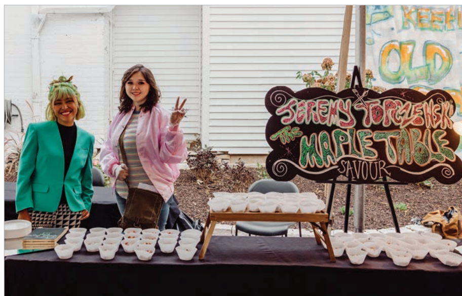
SAVOUR 2021 Fundraiser at Wustum