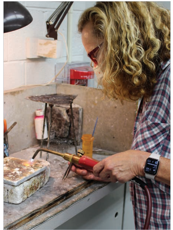
Studio Art Class at Wustum