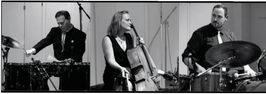
Nineteen Thirteen Concert during Gallery Night at RAM