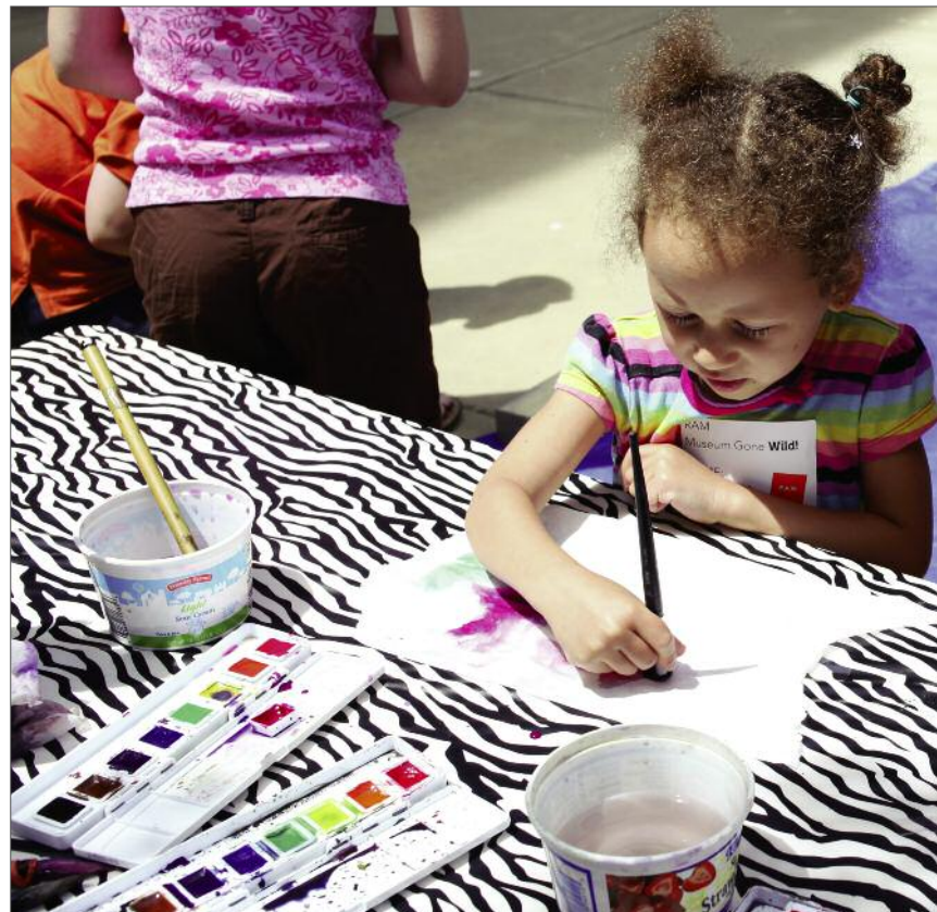
Kids' Day at RAM