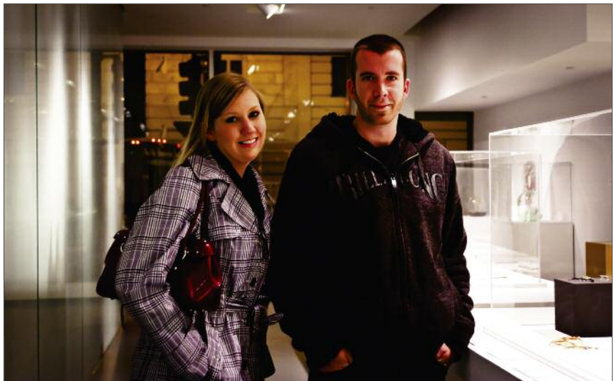
In the Galleries at RAM