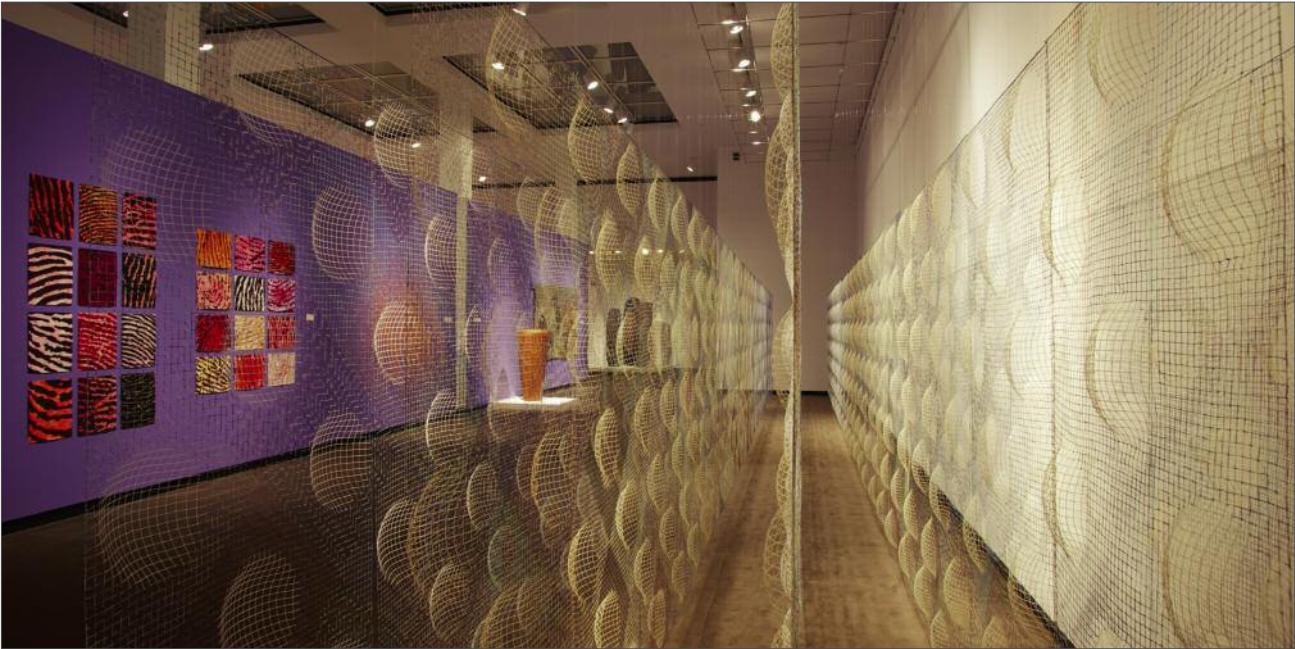
High Fiber: Recent Large-Scale Acquisitions in Fiber Photography: Jon Bolton