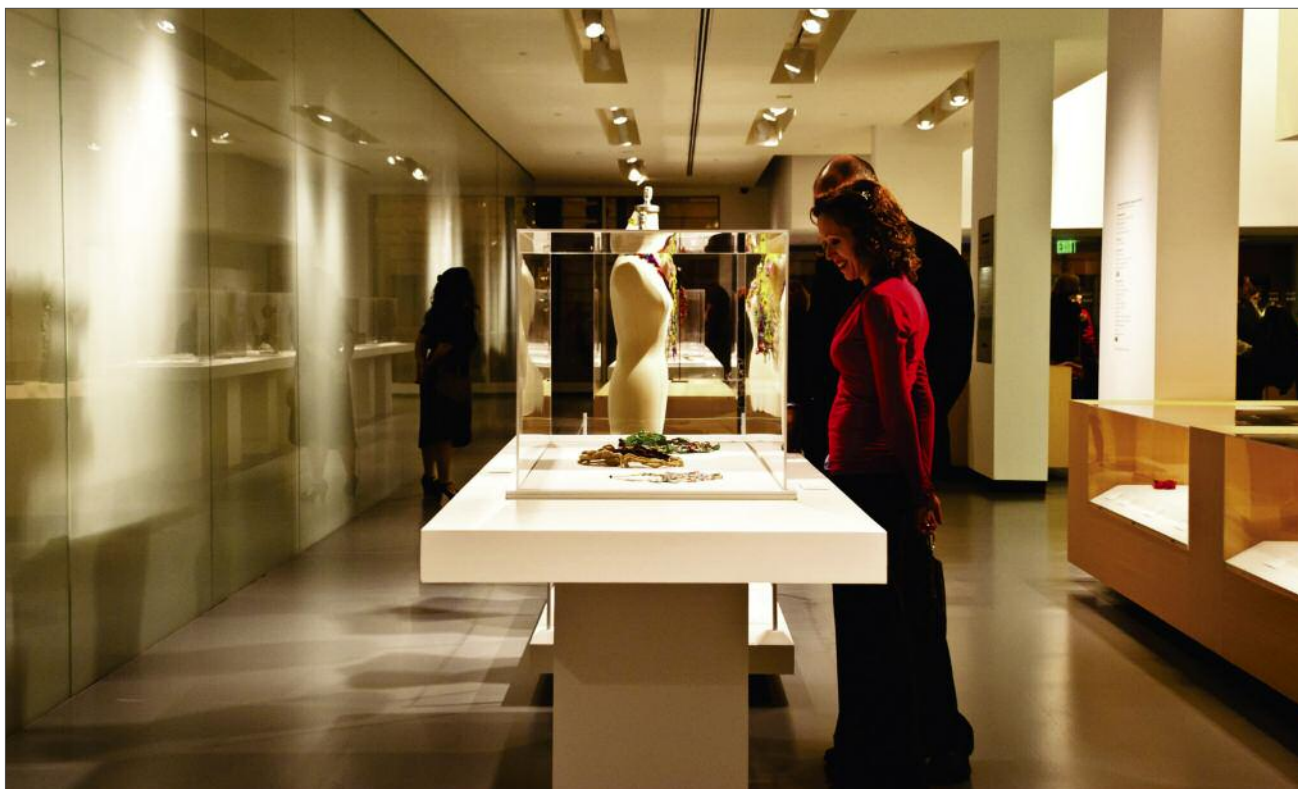
Enjoying the RAM galleries at an evening event