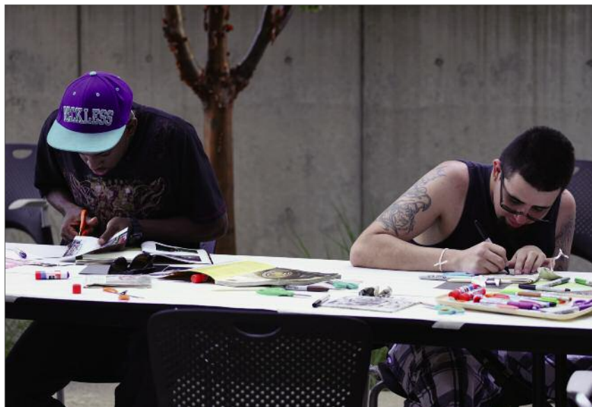
Free Hands-On Art Project during First Friday at RAM