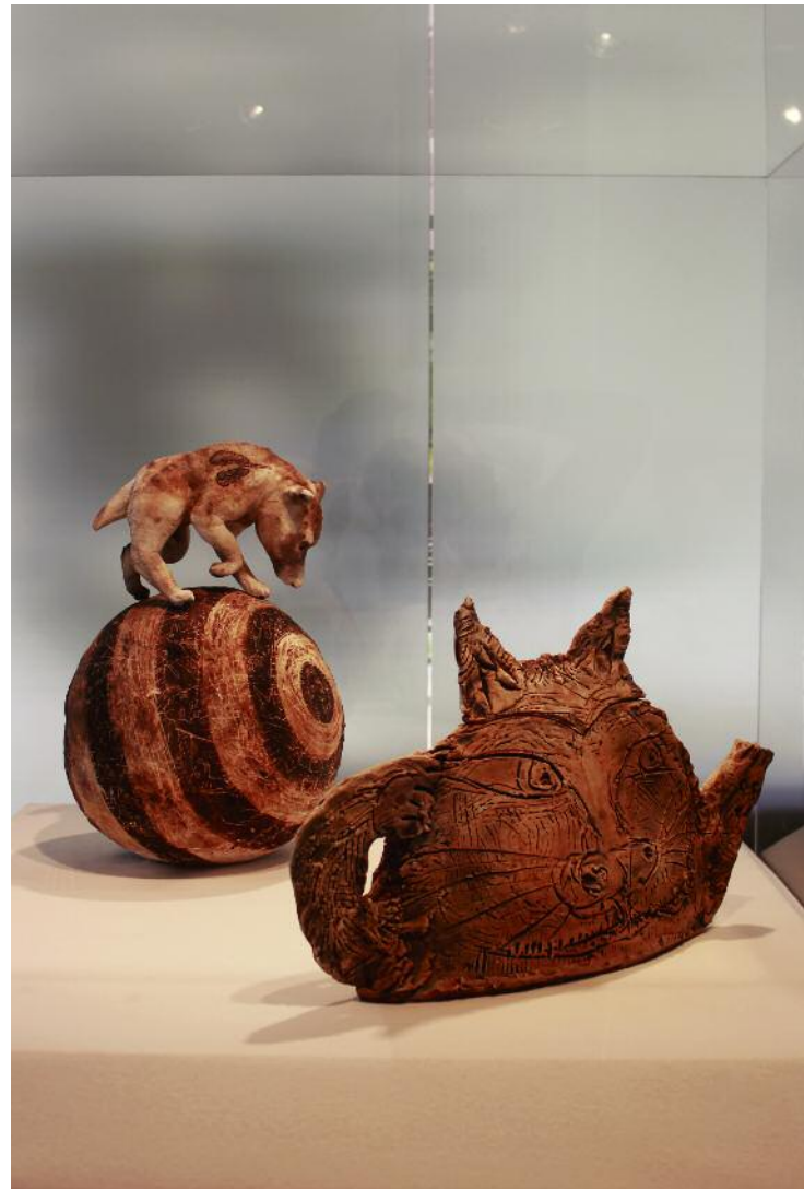
Kids' Art Class, Animal Magnetism: Sculpture from RAM's Collection