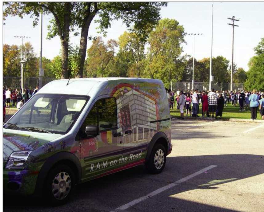
RAM on the Road at McKinley Middle School in Racine

We extend a heartfelt thank you to all of the exceptional volunteers who give their time to RAM and Wustum. We couldn't operate without you as board members, docents, interns, librarians, registrars, gallery guides, committee members, and teacher's assistants.