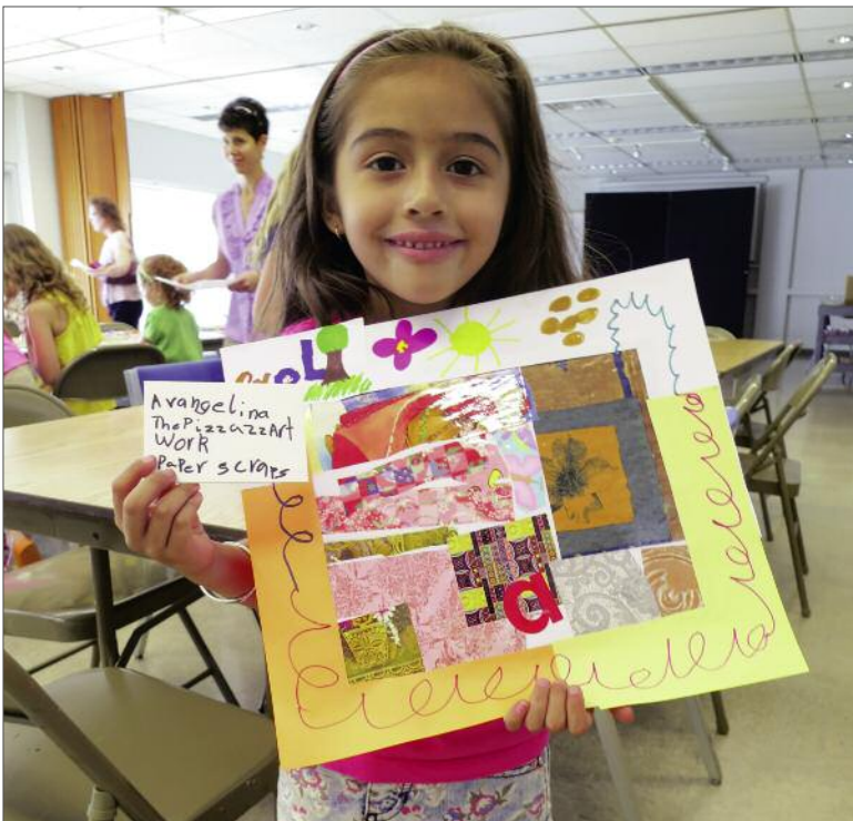
Drop In for Art at RAM's Wustum Museum