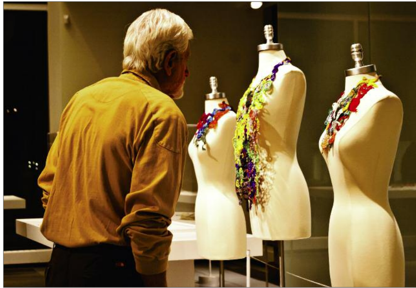
Considering Cutting Edge: RAM Explores Contemporary Glass Jewelry