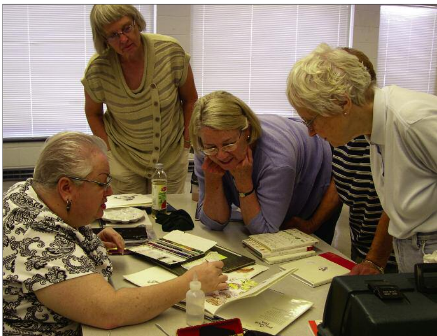
Advanced Watercolor Class at RAM's Wustum Museum