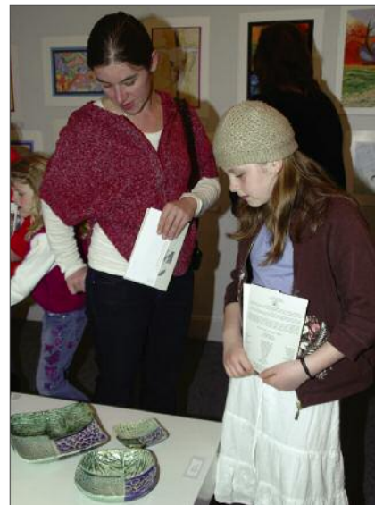
Racine Unified Student Art Exhibition at RAM's Wustum Museum