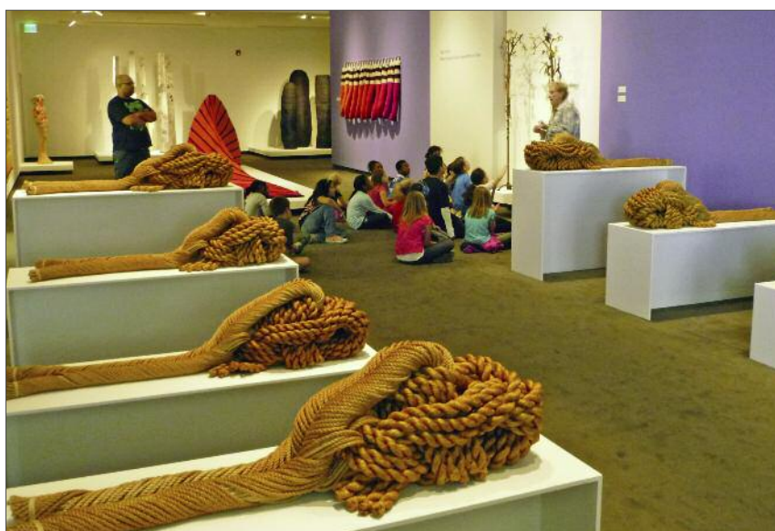
Kids' Tour discovers High Fiber: Recent Large-Scale Exhibitions in Fiber