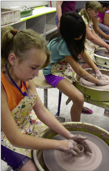
Kids' Art Classes at RAM's Wustum Museum