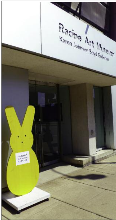
Annual International PEEPS® Exhibition