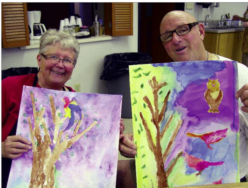
SPARK! Art Activities at RAM's Wustum Museum