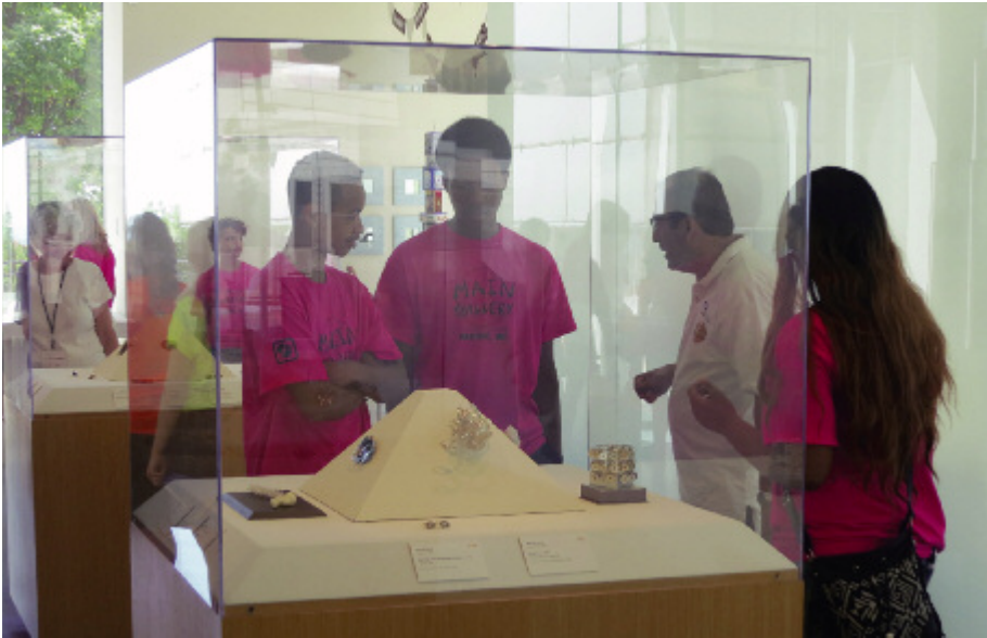
New Acquisitions: Contemporary Art Jewelry at RAM