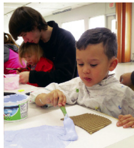
Mommy and Me Art Class at Wustum